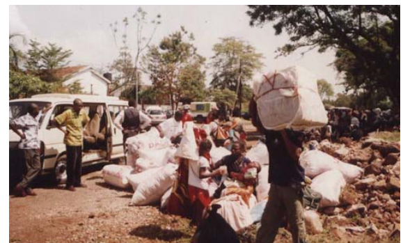
Internally displaced people waiting for registration at the camp set-up by Bishop Abiero after a grueling two day journey from Naivasha.