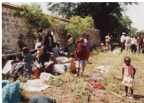
Displaced people wait at the Kisumu Cathedral camp. This three year old girl appears lost. Camp Officials confirmed she has no information on her parents whereabouts